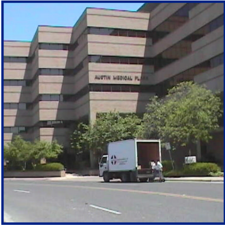
No job too big or too small.

“Sharon Hanson of OfficeKeepers quickly established a professional working relationship with all the clients in the building catering to their every need. She personally meets with the office managers of our tenants on a daily basis to make sure all their needs are being met. She takes on all extra requested jobs and personally makes sure everything runs smoothly with an excellent sense of attention to detail.”