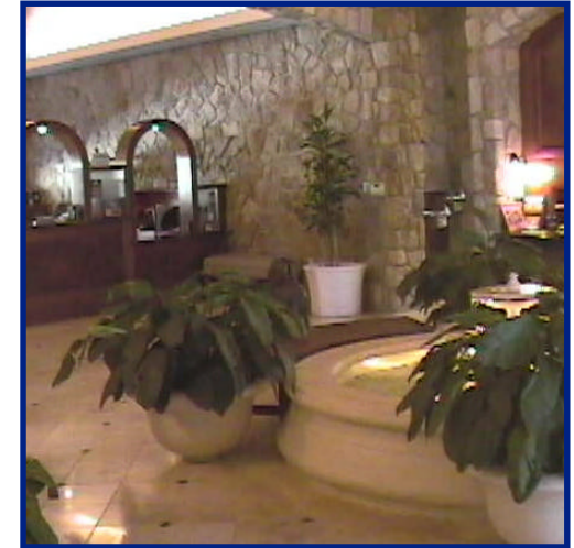
Custom cleaning needs at their finest.

Village Bank and Trust 14,000 Square Feet 1415 Ranch Road 620 Lakeway, Texas 78734 Dala Campbell, Building Manager (512) 261-1122 office number